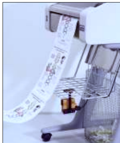
on-line connection to printer