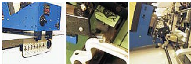
Easy front table mounting