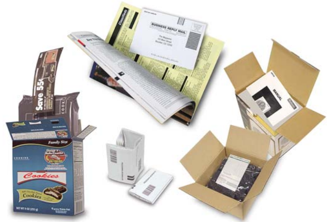
A sampling of the products that can be fed.