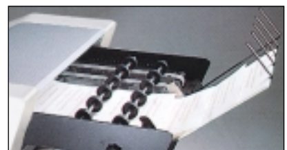
sheet-by-sheet stacker M 3010