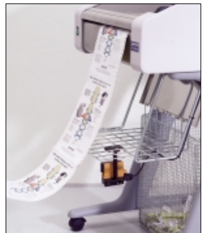
on-line connection to printer