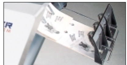
stacker M 3000