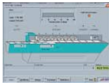
Improved Human-Machine Interface system.