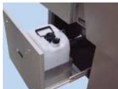
New, easily accessible water system.

Space requirement: 4 stations 2.6 x 1.2 m 6 stations 3.3 x 1.2 m